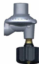
GR-766 90° Body c/w QCC1