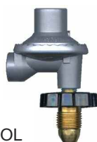
GR-756 90° Body c/w HN POL

*Based on 25 PSIG inlet pressure and 9" W.C. outlet pressure at Manufacturer's set point. Manufacturer's set point = 100 PSIG and 11" W.C. outlet at 40 SCFH propane.